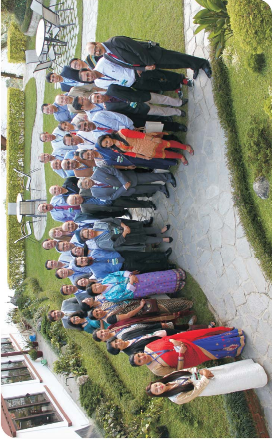
Participants of the Symposium on Comprehensive Prevention and Control of Cervical Cancer, Gangtok, Sikkim, India